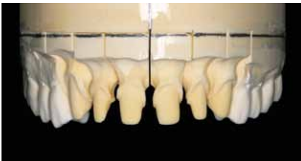
Fig 6 The cast base must be trimmed in parallel with the horizontal landmark. The separation axis of the dies must be oriented according to the vertical landmark.