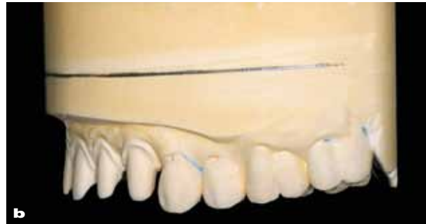
Fig 5 Front and lateral views of the working cast after Ditramax marking.