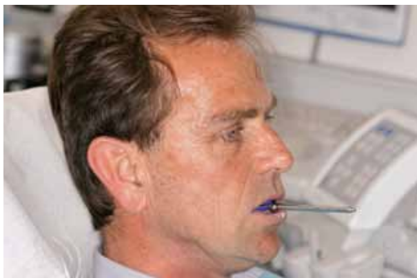
Fig 1 Positioning of the bite fork coated with fast-setting silicone (Aquasyl Bite, Dentsply).