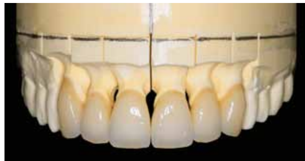
Fig 7 The ceramist will be able to elaborate the prosthesis with an incisal plane parallel to the interpupillary line and a dental midline parallel to the facial midline.