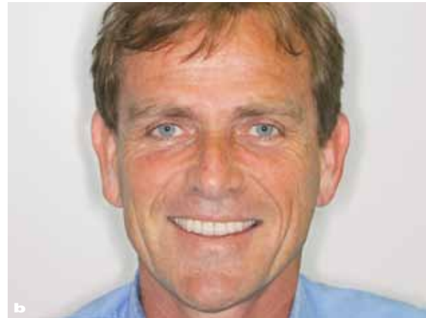
Fig 8a and 8b Clinical view of the final result (Zirconia Procera crown).

based upon the position of the patient's teeth in relation to the gingiva, lips, and face. The Ditramax system allows for the straightforward casting of the interpupillary line (the horizontal esthetic reference line) onto the oral area, which is used to identify major esthetic errors and then to develop a therapeutic program that will lead to a harmonious and natural-looking dentogingival solution. In addition to its diagnostic utility, the ability of the Ditramax to accurately represent all of the reference lines in the laboratory allows for a substantial reduction in dental