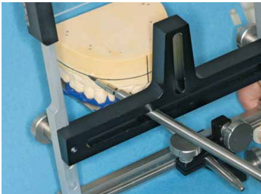
Fig 4 The working cast is positioned onto the fork, where it fits perfectly because of the occlusal indentation in the silicone. A pencil is used to trace the cast through the template; the horizontal line represents a parallel to the interpupillary line (front view), as well as a parallel to Camper's plane (side view). The vertical line represents the facial midline.